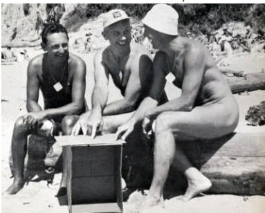
XB58 Beach, June 1958