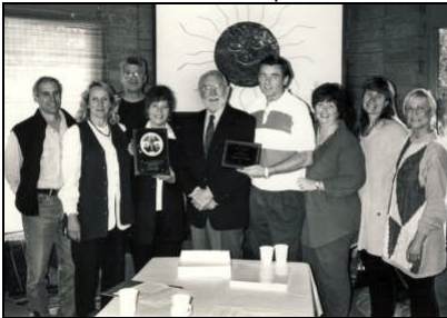
1995 Topanga Chamber of Commerce Citizen of the Year.

to organize for nude access to beaches and public lands.